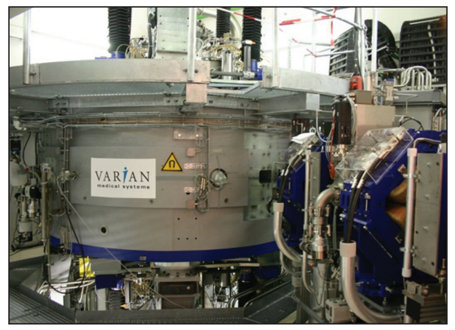
FIGURE 2. Cyclotron Varian ProBeam. A 90-ton cyclotron (left) is the centerpiece of the fully integrated ProBeam proton therapy system at Scripps Proton Therapy Center. The technology is manufactured by Varian Medical Systems. (Photo courtesy of Varian Medical Systems).

laboratory to something you can now buy. Today, there are a number of vendors you can chose from, and there is competition in the market, including Varian, Hitachi, IBA, and Mevion," said Dr. Rossi. "Facilities are now designed for a high-patient throughput. At our facility, with 5 treatment rooms, we expect to treat up to 200 patients a day—this allows us to spread the unit cost per treatment. We are now running a 16-hour treatment day. That's helping reduce the costs."