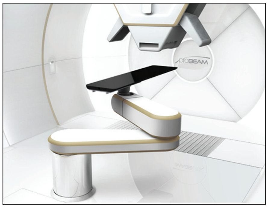
FIGURE 1. Varian Probeam treatment room. Scripps Proton Therapy Center is being developed by Advanced Particle Therapy, LLC of San Diego, CA, and will be operated by Scripps Health and Scripps Clinic Medical Group. The center is due to open for patient care in summer 2013.