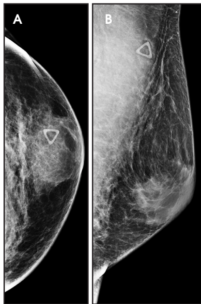
FIGURE 1. (A) Craniocaudal view of the left breast demonstrated a focal asymmetry present at 12 o'clock at the site of the triangular palpable marker. (B) Mediolateral-oblique view of the left breast demonstrated the same focal asymmetry.

Craniocaudal (Figure 1A) and mediolateral-oblique (Figure 1B) views of the