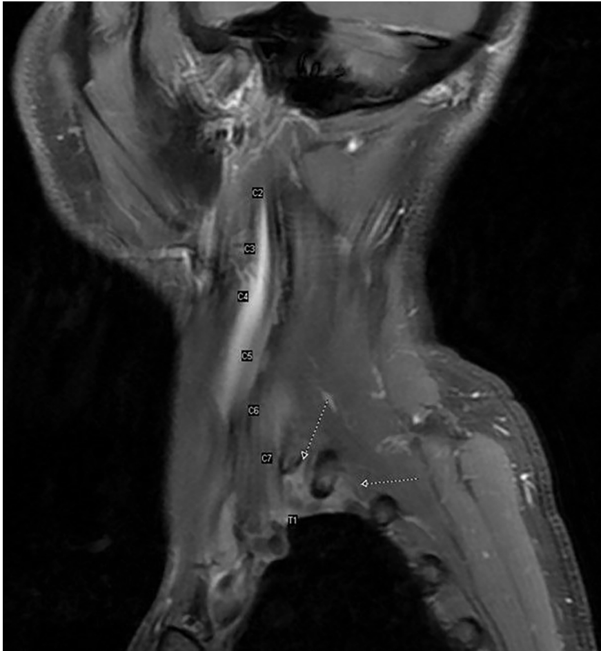
FIGURE 4. Sagittal postcontrast T1-weighted MRI of the left brachial plexus demonstrates enhancing soft tissue within the region of the left neuroforamina at C7-T1, T1-T2, and to a lesser extent C6-C7, suspicious for lymphomatous involvement of the brachial plexus.

mass that is mobile and nontender. 1 However, presenting symptoms can be quite variable. Hoimes et al described a case of Hodgkin's lymphoma of the breast that presented as cellulitis. 3 Anne and Pallapothu described a case of Non-Hodgkin's lymphoma of the breast that presented similar to inflammatory breast cancer. 2