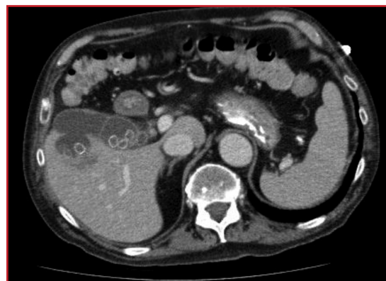
FIGURE 2. Direct communication between the posterior inferior wall of the gallbladder and the fluid collection.