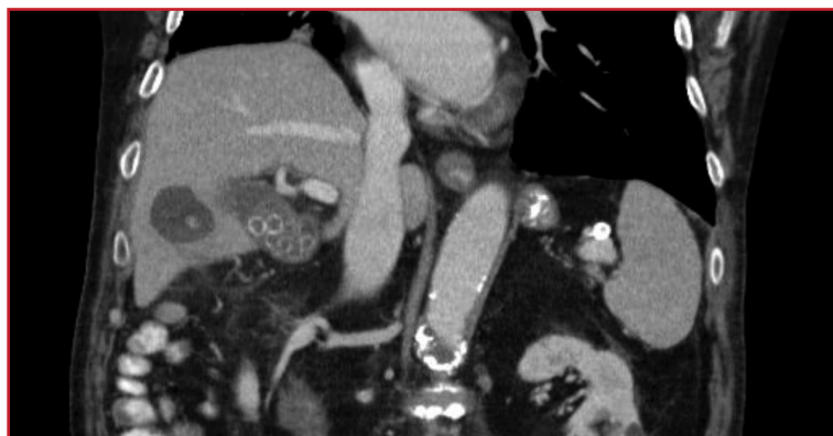
FIGURE 1. Contrast-enhanced CT of the abdomen with coronal reconstructions demonstrated a 3.5 cm intrahepatic fluid collection in the right hepatic lobe.

(Click on the images framed in red to view them in a DICOM viewer powered by EXA-PACS.)