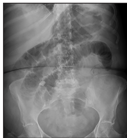
FIGURE 1. Abdominal X-ray. Distended small-bowel loops are observed (several loops have a diameter greater than 3 cm). Distal aeration is present, with existing air bubbles in the rectum. Given these findings, the diagnosis of subocclusive ileus or progressive occlusive ileus was established.

Although they are two relatively common entities, the fact that both phenomena can occur simultaneously (Richter's herniation through