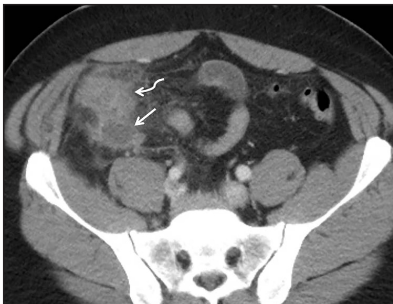
FIGURE 2. Coronal reconstruction from the contrast-enhanced CT performed 4 months after initial presentation. An approximately 3 cm rim enhancing fluid collection is visualized in the right lower quadrant (arrow), posterior to a secondarily inflamed cecal tip (curved arrow). This small abscess was two slices superior to the perforated loop of ileum depicted in Figure 1.