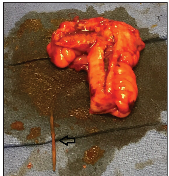
FIGURE 3. Gross specimen of the resected 15 cm segment of distal ileum. The bowel wall is thickened with hemorrhagic and edematous serosa and fibrinous exudate. A 6 x 0.2 cm wooden toothpick was retrieved (open arrow).

Clinical presentation is quite variable, and can be acute, subacute, chronic, or even asymptomatic. 2,4 Generally, patients with gastric or duodenal perforation present with acute severe pain due to a rapid chemical peritonitis secondary to spillage of ero-