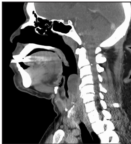
FIGURE 2. Sagittal CT image shows a low-attenuation mass anterior to the cervical vertebrae, causing significant narrowing of the airway.