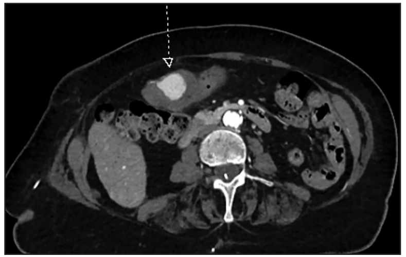
FIGURE 1. Axial contrast-enhanced computed tomography showing 2.3 cm pseudoaneurysm (arrow) before treatment.