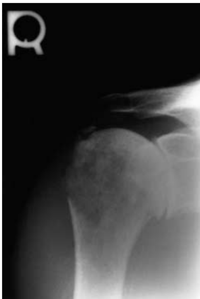
Figure 1 Plain-film radiograph of the right shoulder. Note the large, ill defined, moth-eaten lesion located on the lateral two-thirds of the humeral head (arrows), with destruction and fragmentation of the greater tuberosity (arrowheads). Note the incidental calcific deposit within the supraspinatus tendon (hatched arrow).

Subjective improvement was reported over the next two weeks, at which time a re-evaluation was performed. Palpable tenderness, moderate swelling, and decreased cutaneous sensation was found over the humeral head. A painful arc from 45 to 90 degrees, and a positive drop arm