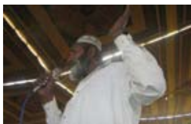
The People's Assembly at Manchar Lake, Pakistan.