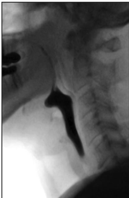
FIGURE 3. Representative image from a modified barium swallow study (MBSS) (Image courtesy of: Jo Ann Puntill-Sheltman, SLP, Intermountain St. George Regional Hospital, UT).

reproducible MBSS; 5 they also improve patient safety, increase efficiency, and reduce waste. Simply diluting standard BaSO 4 preparations for the MBSS does not eliminate mucosal coating, creates different (and possibly excessively low) radiodensities, creates unknown viscosities, and dilutes the helpfulness of the additives in unpredictable, and likely unfavorable, ways.