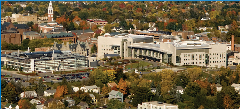
After evaluating the options, the UVMMC team selected Philips' Vereos digital PET/CT.