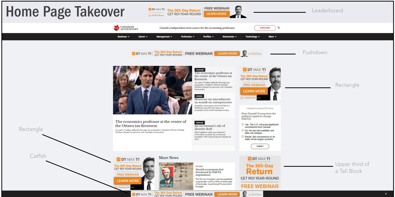
Thomson Reuters DT MAX T1 campaign homepage takeover, September 2017.