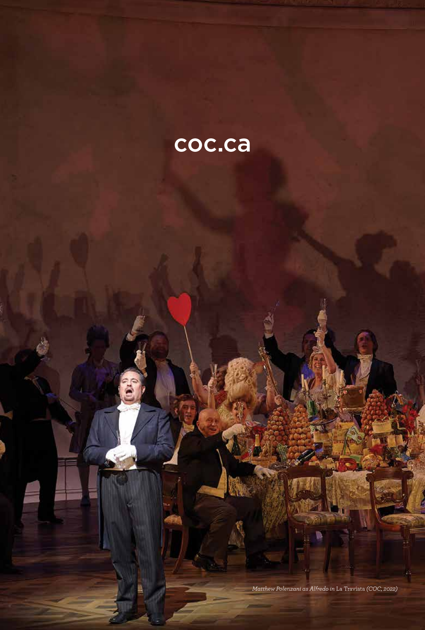
Matthew Polenzani as Alfredo in La Traviata (COC, 2022)