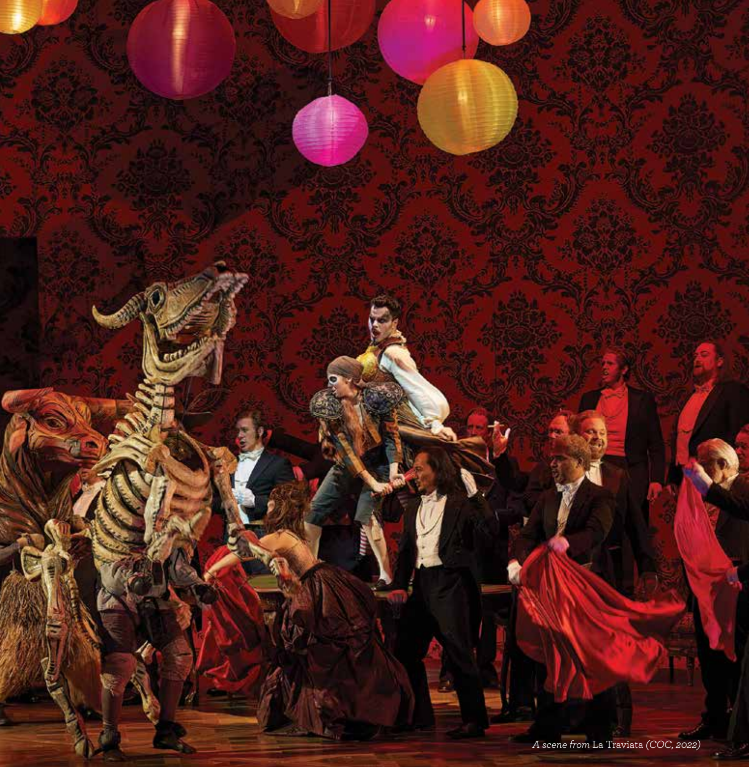
A scene from La Traviata (COC, 2022)

For complete cast and creative team information, as well as a list of the valued donors, supporters, and committee members who made this season possible, please visit coc.ca/2122AnnualReport or scan here: