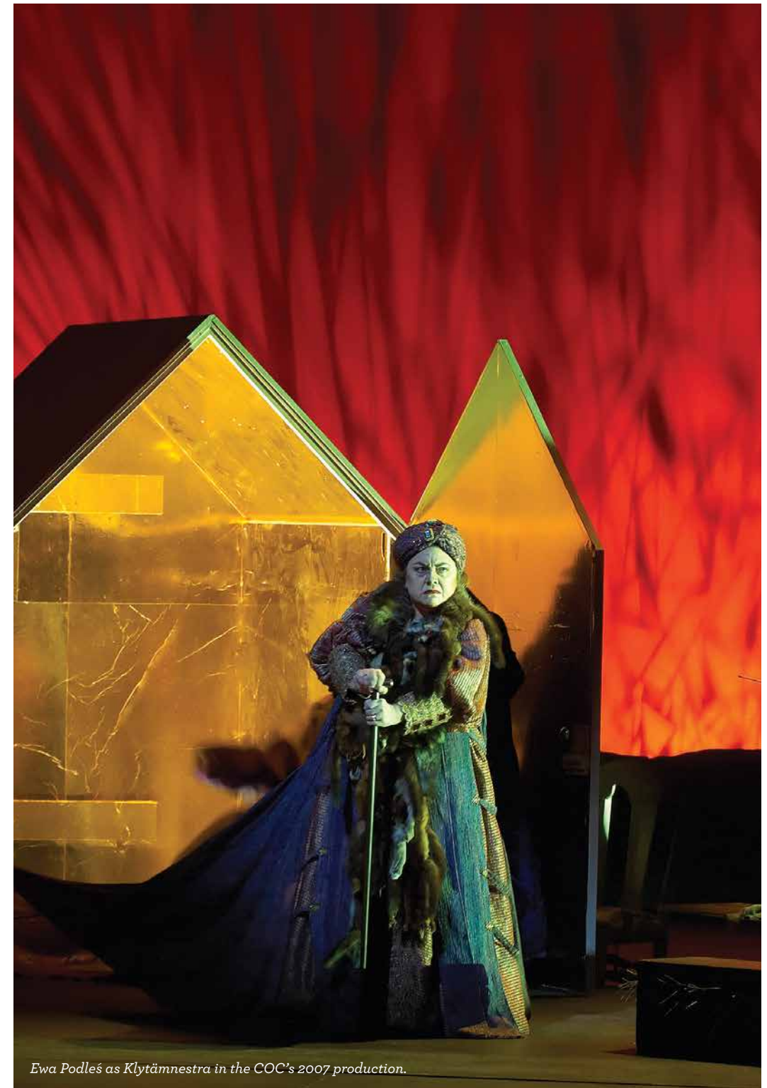
Ewa Podleś as Klytämnestra in the COC's 2007 production.

This event is free but requires a ticket for entry. Call 416-363-8231 or visit coc.ca/OperaInsights