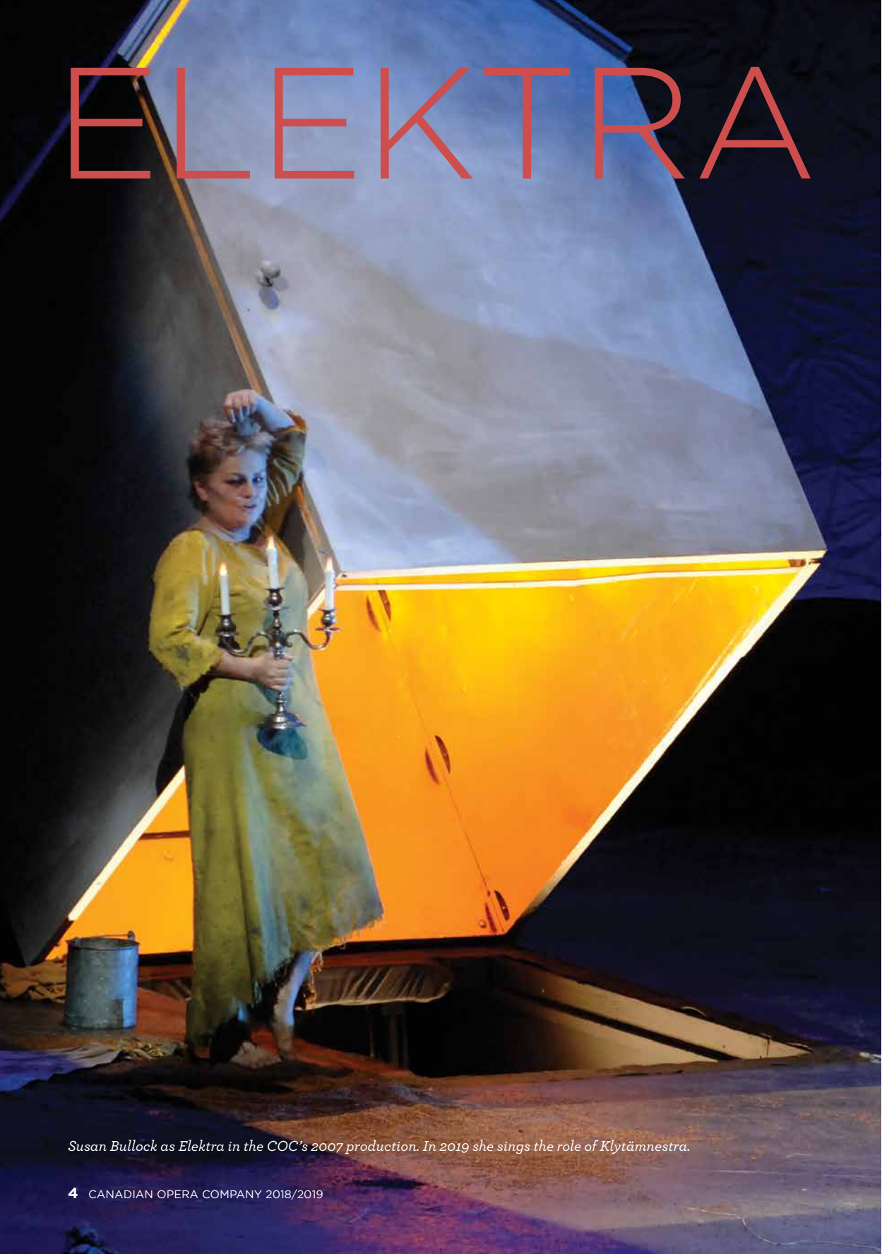
Susan Bullock as Elektra in the COC's 2007 production. In 2019 she sings the role of Klytämnestra.