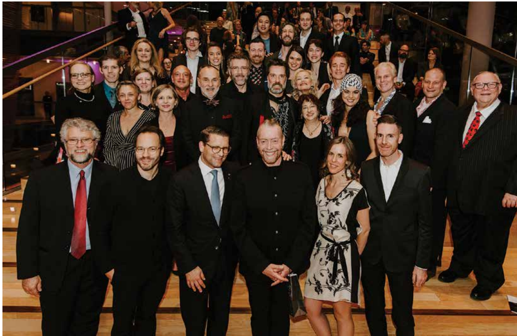
What a night! The cast, creative team, staff and donors celebrated the opening night of the COC's world premiere of Hadrian with a post-performance toast.

Here is a look at some of our recent activities, many shared with our wonderful COC donors, including parties, galas, and backstage meet-and-greets with artists.