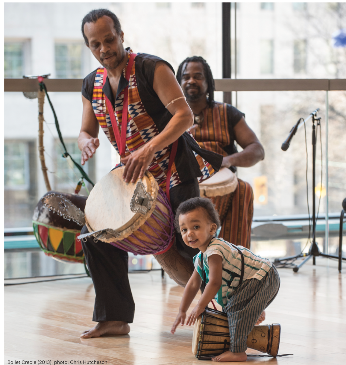
Ballet Creole (2013)

Against the Grain Theatre is a participant of the COC Academy — a home for Canada's new wave of opera creators and an incubator for the future of the art form.