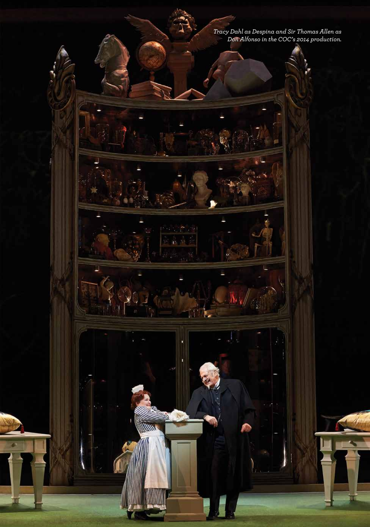
Tracy Dahl as Despina and Sir Thomas Allen as Don Alfonso in the COC's 2014 production.