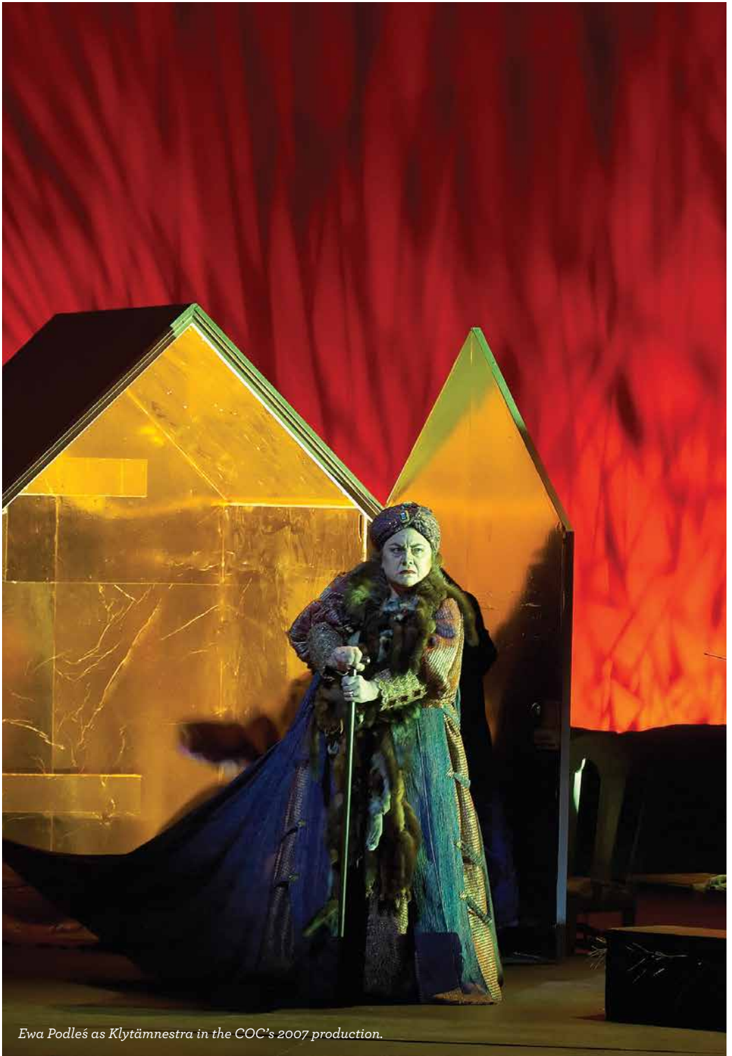
Ewa Podleś as Klytämnestra in the COC's 2007 production.