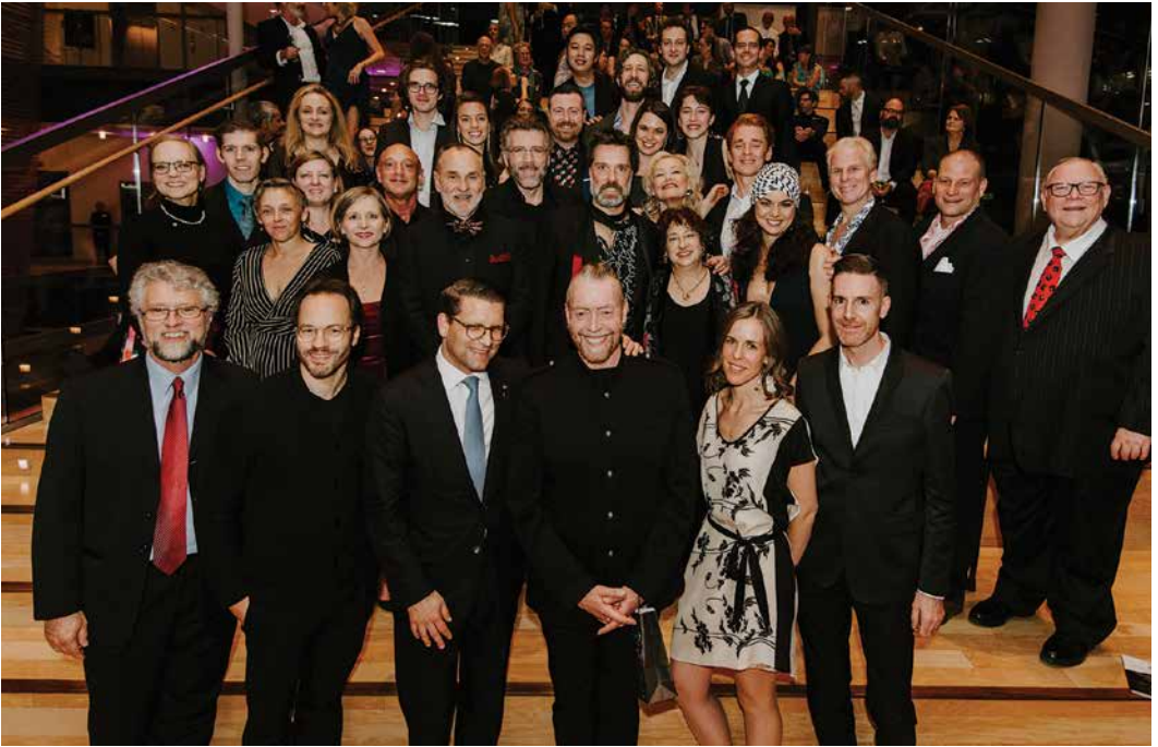
What a night! The cast, creative team, staff and donors celebrated the opening night of the COC's world premiere of Hadrian with a post-performance toast.

Here is a look at some of our recent activities, many shared with our wonderful COC donors, including parties, galas, and backstage meet-and-greets with artists.