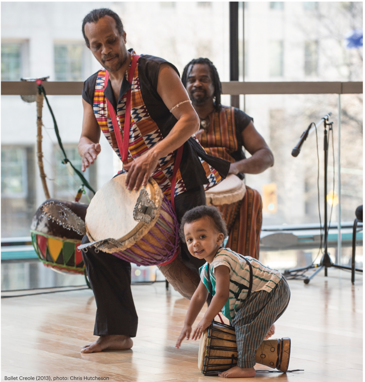
Ballet Creole (2013), photo: Chris Hutcheson