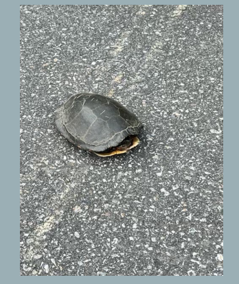
College Drive: Parking Lot 9

Each nesting turtle was observed from a distance and a turtle nest protector was placed over the nest area once the laying female had independently left the area. The turtle nest protectors act as an effort to prevent predation or damage to the buried turtle eggs. Canadore's Sustainable Development Committee would like to recognize and give special thanks to all of the individuals involved in building the turtle nest protectors. Great things really do happen here, one turtle egg at a time!