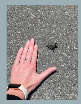
College Drive: Hewgill Hall Entry