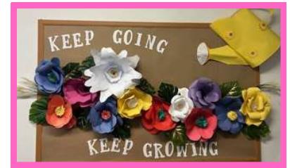
BULLETIN BOARD CREATED BY FABIOLA LAMOTHE