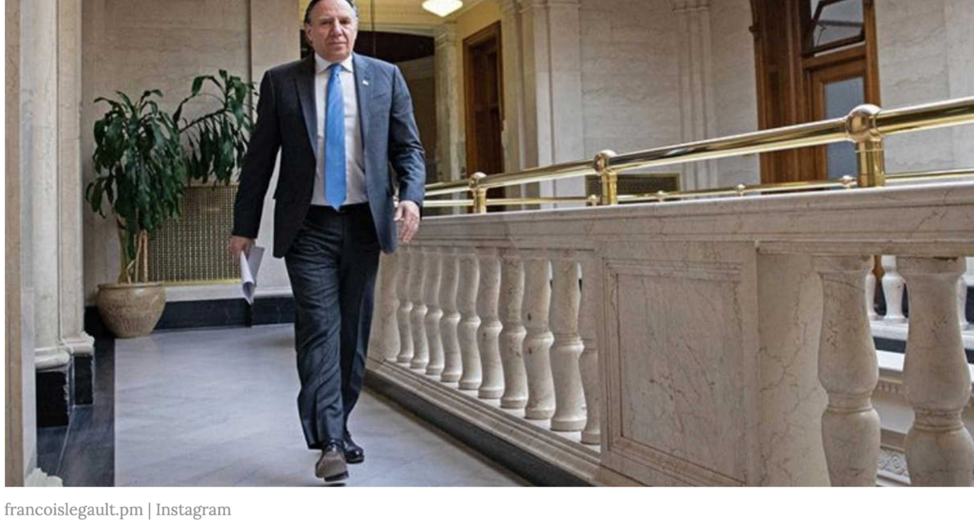
francoislegault.pm | Instagram