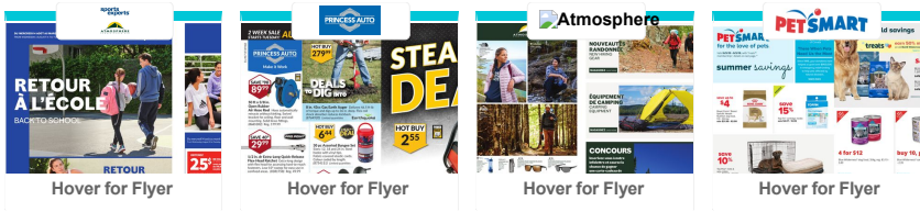
Hover for Flyer