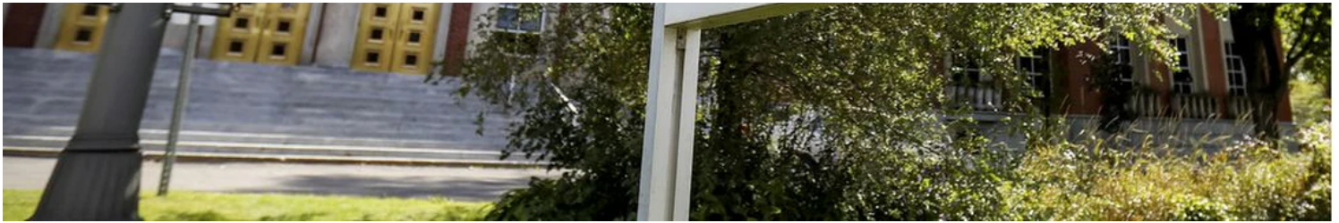
The English Montreal School Board offices in Montreal.

The English Montreal School Board says an independent financial review it ordered in 2017 to track what was thought to be millions of dollars in missing international student tuition fees turned up nothing nefarious and raised no red flags.