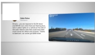
B.C. police using social media to discourage bad driving