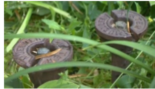
Does your home have lead water pipes? Montreal will replace them - and send you the bill