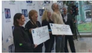
Quebec lottery winners 'in shock'