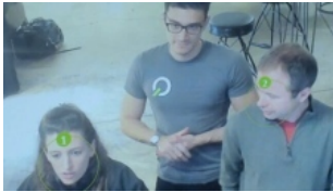
A London bar is using facial recognition; what does that mean for Canada?