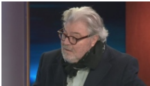
'A recipe for war': Power conflicts in the Middle East as countries strike back-door deals