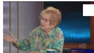
Ask Dr. Ruth: Sex, politics and abortion