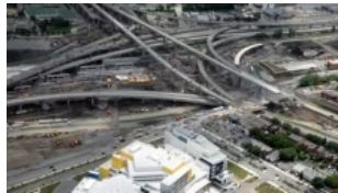
Weekend road closures: major Turcot, Highway 20 construction this weekend