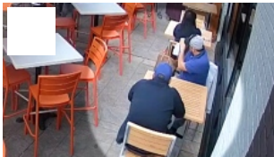
Video shows distraction theft at Toronto-area patio