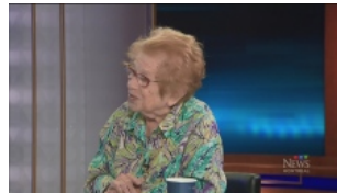
In conversation with Dr. Ruth: Sex, politics and abortion