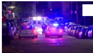
Morning news: Violent night in Montreal-North