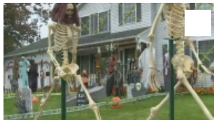
Halloween, inspired by The Beatles' Abbey Road