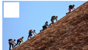
Australia's Uluru sacred site permanently closed to climbers