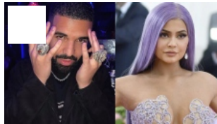
Drake and Kylie Jenner rumours swirl after his birthday bash