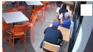
Video shows distraction theft on Markham patio