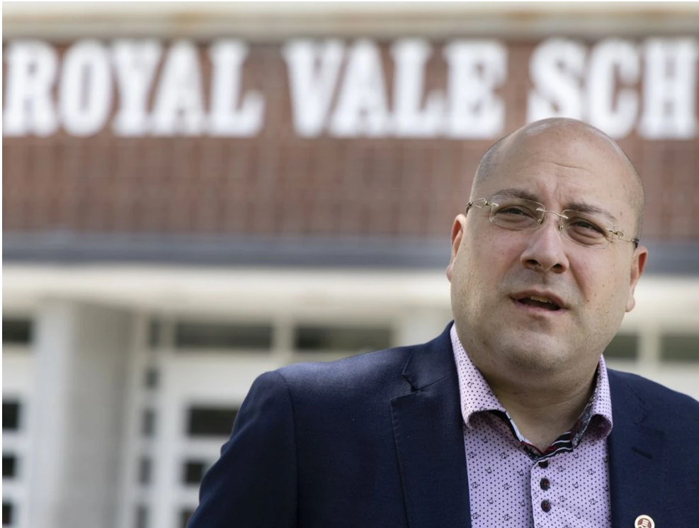
Premier François Legault "seems willing to do anything to deflect attention from legitimate opposition to his proposed