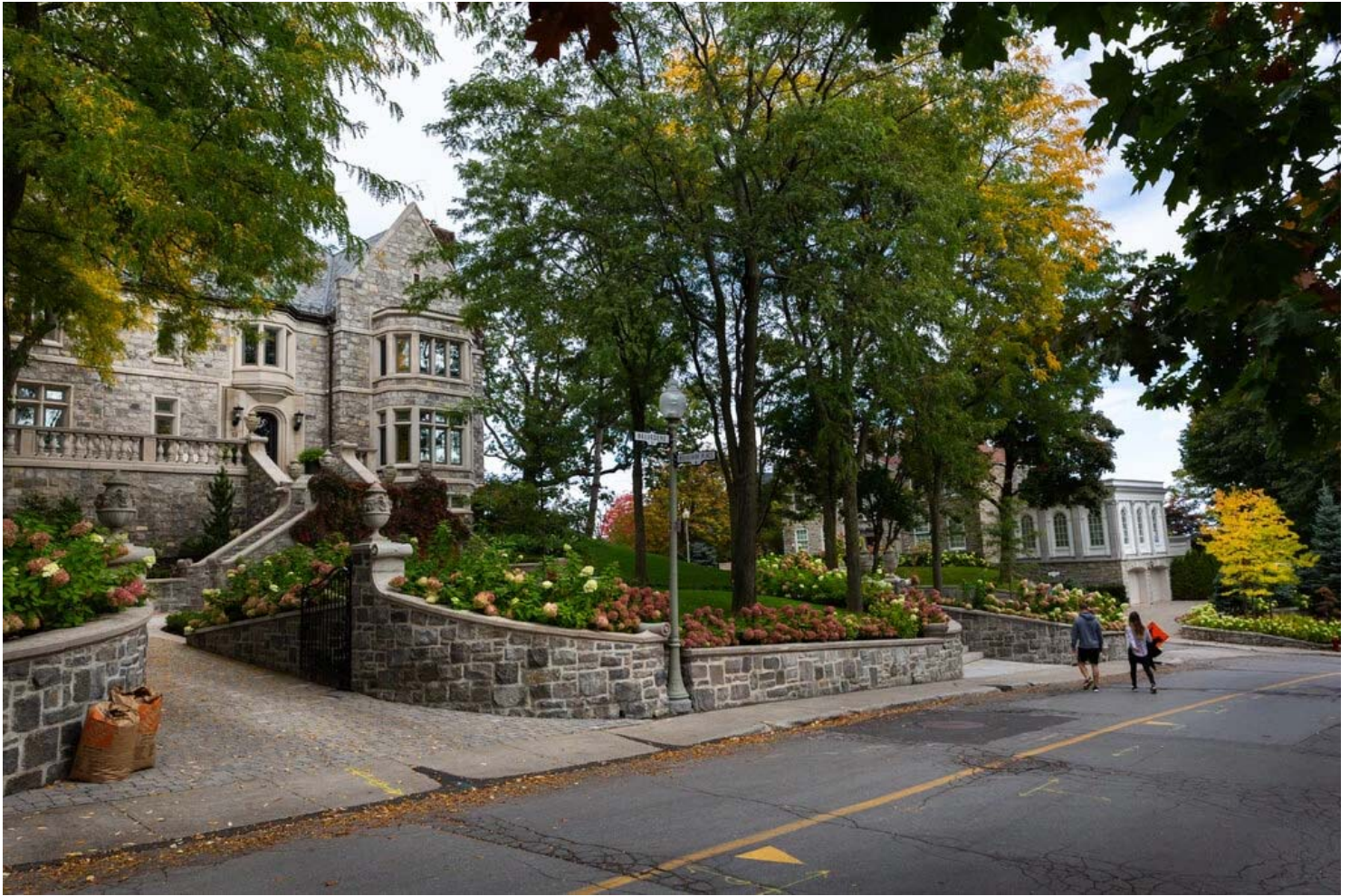
The area of Westmount in Montreal was home to many of Westmount High's wealthy students.

“My mother tried to make it sound like an adventure, taking us to buy our first down jackets and mittens, as though we were going to be explorers of the great northern winter,” she wrote. “But it was hard for me to see it that way.”