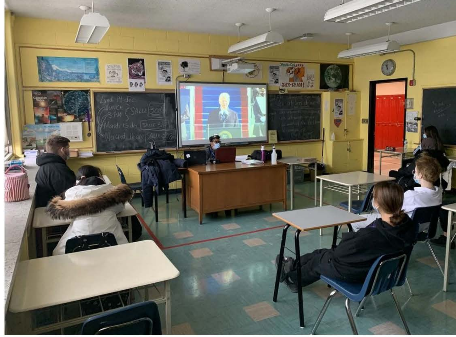
Students at Westmount High School watch the inauguration of U.S. President Joe Biden on Jan. 20, 2021.

Bill Brownstein · Montreal Gazette Jan 21, 2021 · 4 minutes ago · 4 minute read