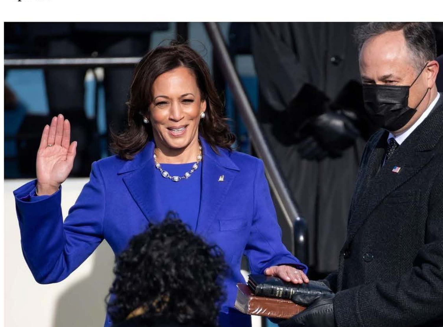
Kamala Harris is sworn in as vice-president as her spouse, Doug Emhoff, holds a bible during the 59th Presidential Inauguration in Washington on Jan. 20, 2021.