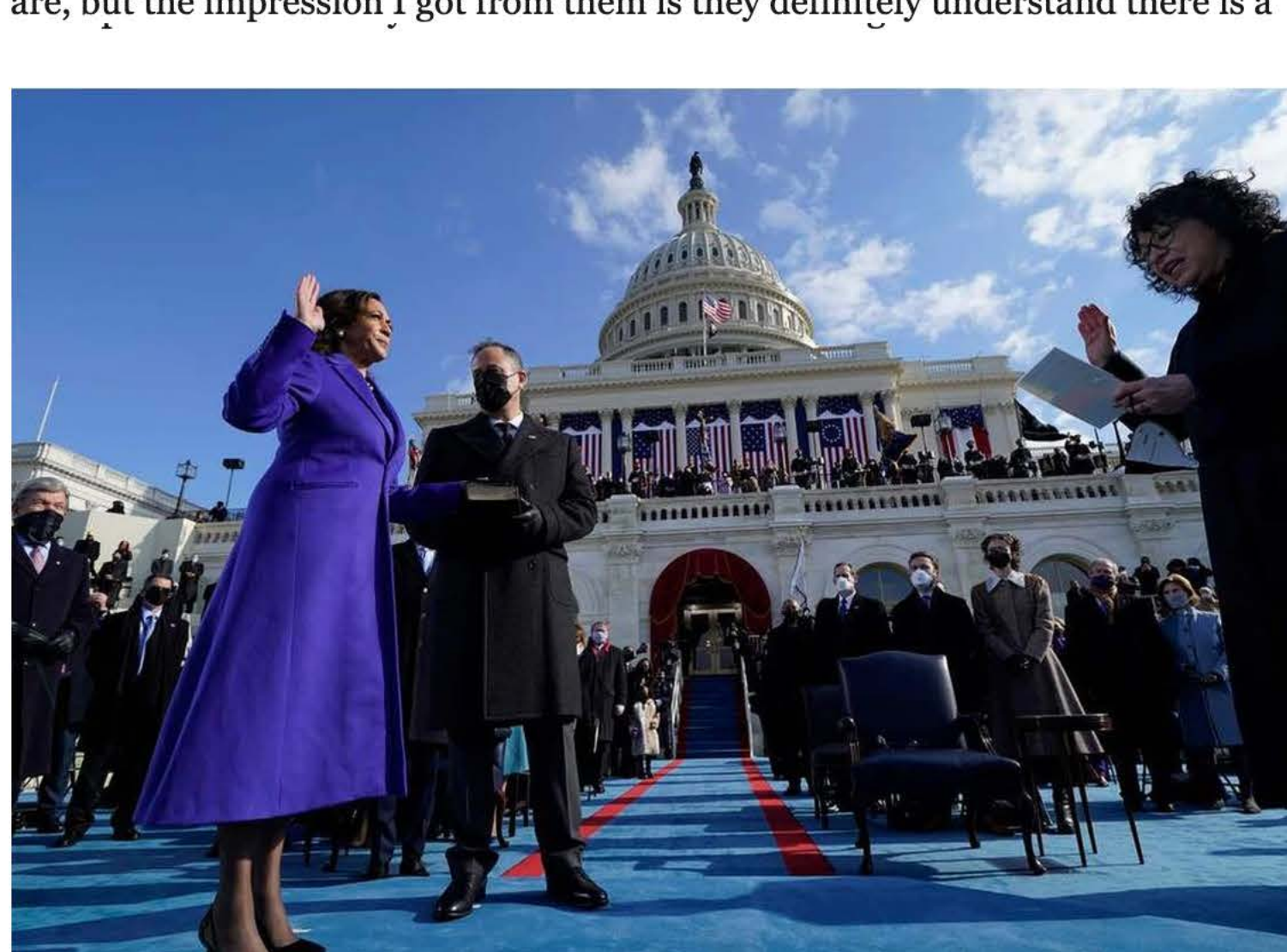
Kamala Harris, with her husband, Second Gentleman Doug Emhoff, is sworn in by Justice Sonia Sotomayor as the 49th U.S. vice-president on Wednesday.