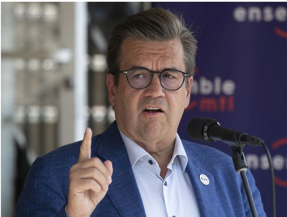
“I recognize Quebec as a nation, as does our political party,” Ensemble Montréal Leader Denis Coderre said in response to an EMSB document challenging Quebec’s nationhood. The Montreal mayoral candidate is seen at Jean Talon Market on July 15, 2021.

This advertisement has not loaded yet, but your article continues below.