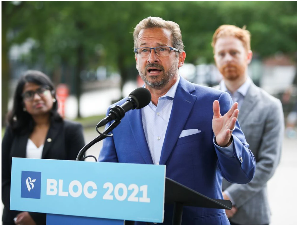
Bloc Québécois Leader Yves-François Blanchet, seen in a file photo, said the EMSB document is an "insult."

This advertisement has not loaded yet, but your article continues below.