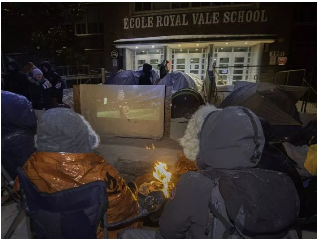
A fire kept parents warm and the Super Bowl kept them entertained as they prepared to camp out overnight for a coveted kindergarten spot at Royal Vale in N.D.G. on Sunday.

RENÉ BRUEMMER, MONTREAL GAZETTE ( HTTPS://MONTREALGAZETTE.COM/AUTHOR/RBRUEMMER ) Updated: February 5, 2019