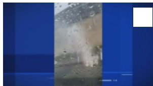
Watch: Montreal streets severely flooded