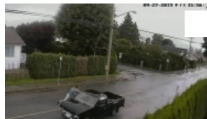
Cameras record bizarre hit-and-run in B.C. neighbourhood