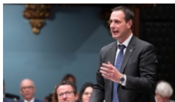
Quebec Education Minister Jean-Francois Roberge announced $2.3 billion Sept. 22 to help with renovations in the province's schools.