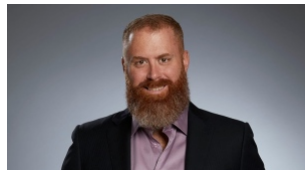
Montreal-area NDP candidate withdraws over domestic violence allegations