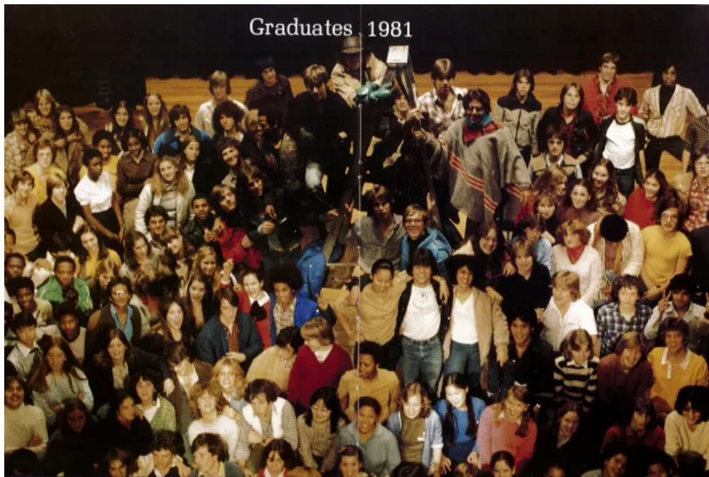
Kamala Harris' high school class photo. She's near the middle, just right of center.