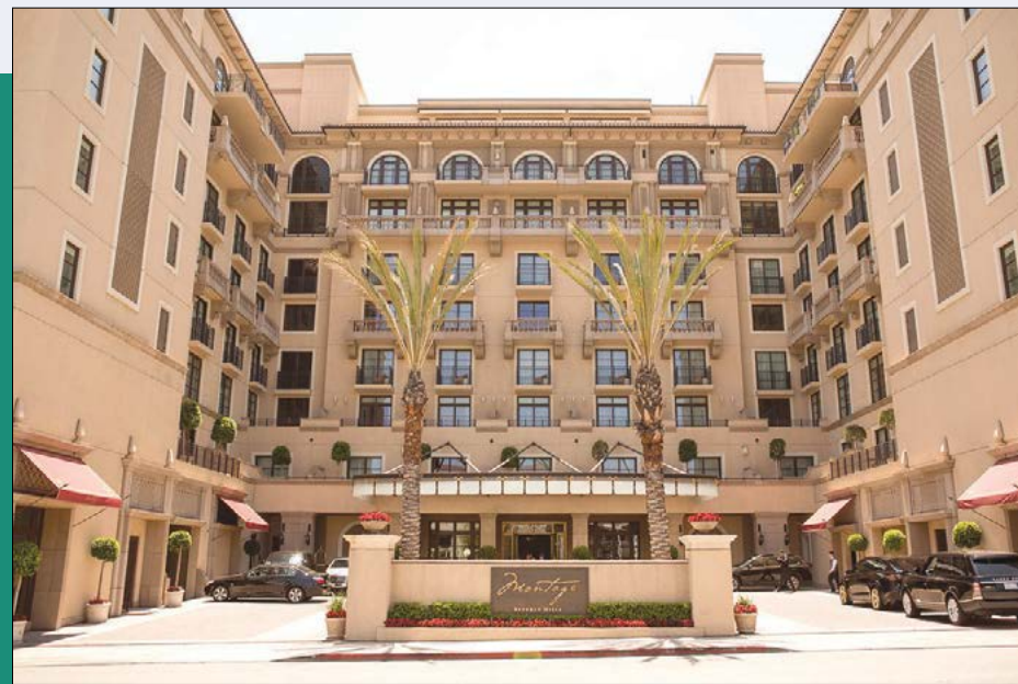
The front of the gorgeous Beverly Hills Montage Hotel.

Montage Beverly Hills was the first hotel and residences to receive Gold LEED certification in Southern California. In 2015, Montage Beverly Hills was named the #1