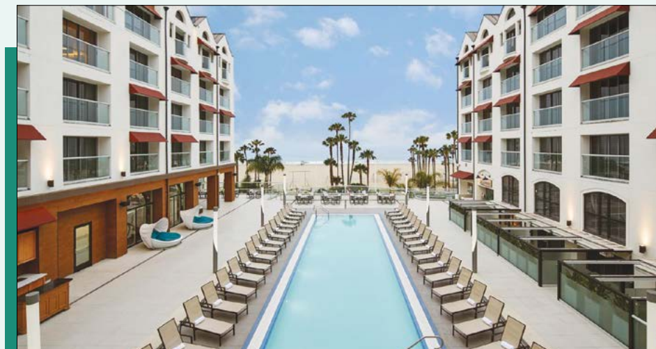
The Loews Santa Monica poolside.

This hotel has 347 luxurious guestrooms including 21 suites (all including white noise machines). There is 17,000 square feet of indoor function space, with ocean views, an Eco-friendly full-service spa offering organic treatments and the Ocean & Vine restaurant, which serves locally caught seafood and fresh farmers' mar-