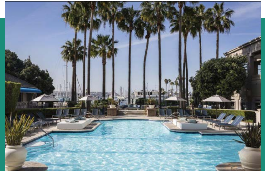
The beautiful pool at the Ritz-Carlton Marina del Rey has handicapped lifts.