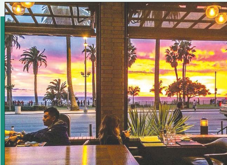
The oceanfront view at the Water Grill Restaurant.

need to be able to walk along sidewalks without having to go around obstacles into the street. Excessive leaves become slippery and a hazard when they are wet.