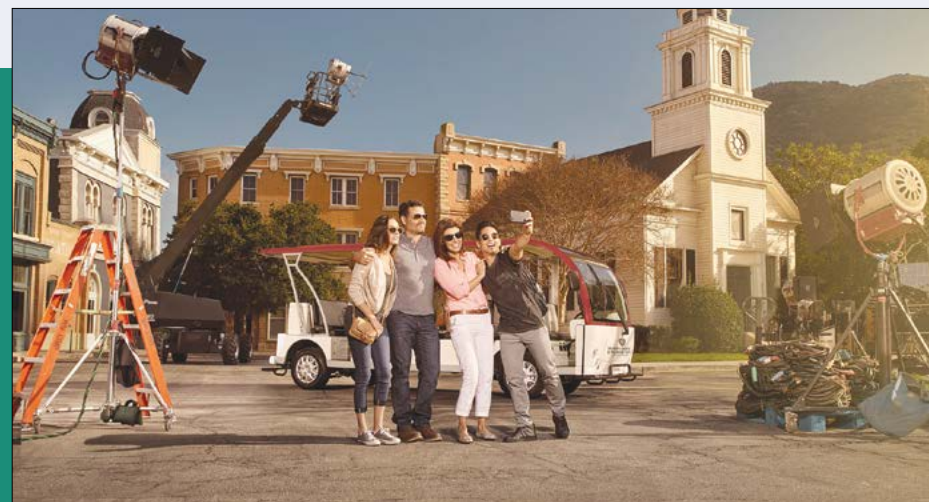
A scene from the Warner Brothers Studio tour.

Soundstage and Backlot availability is subject to change daily due to production on the lot. No two tours are alike. A studio and deluxe tour experience is unique every day of the week. And with more than 450,000