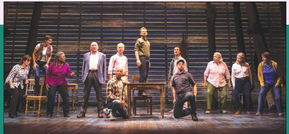
The cast of Come from Away.

The theatre is not completely wheelchair accessible. While there are no steps into the building from the sidewalk, there are within the facility. Seating is accessible to all parts of the Orchestra without steps. There are