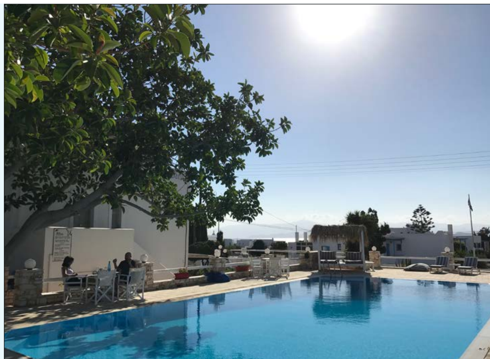
Poolside at the Margarita Studios Hotel.