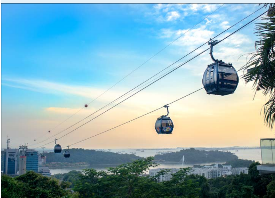
The cable cars in Singapore.

A trip to Singapore would not be complete without a visit to Faber Peak. A natural oasis on the southern edge of the city, from a picnic on the mountain to hiking its trails, a number of outdoor activities await you on the Mountain of Happiness. Early risers should make the peak their first stop, especially if they're staying on Sentosa Island, which is connected to the Peak via accessible cable car. Offering a stunning view by day or by night, the cable car is also a must-do while in Singapore. If time allows, try to experience the cable car by Dining on Cloud 9, where guests can enjoy a four-course meal while traveling high above Singapore.