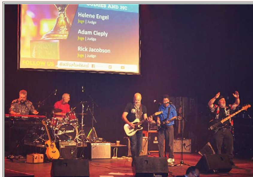
Bando played to a full house at Rock for Dimes in Montreal.