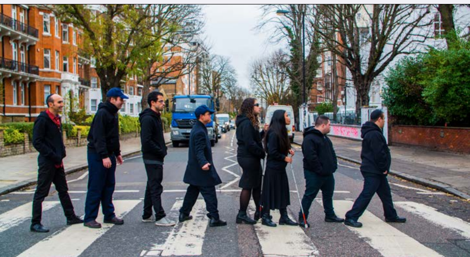
The Shalva band on Abbey Road.