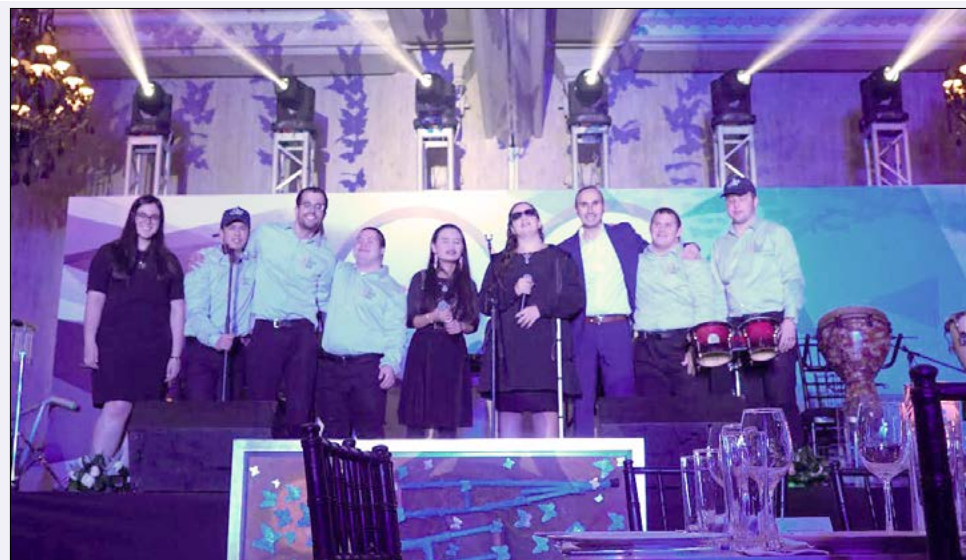
The Shalva band performing in Mexico.

sought healing in music therapy. Creating a band for those differently-abled then became a form of personal rehabilitation.