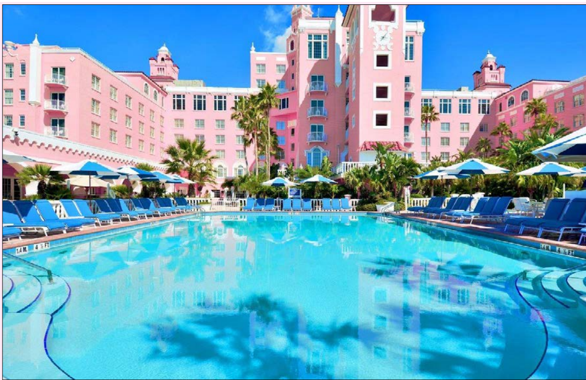
One of the pools at the Don CeSar.

Hearing impaired guests can take advantage of written materials that they receive upon check-in, including the Daily Resort Activities guide and reading boards that are on the lobby floor next to the elevators. The hotel also provides notepads and pens for speech and hearing impaired guests who would prefer to communicate in writing. The bell desk employees offer to escort guests with vision and hearing impairments to their rooms and other hotel outlets. Those with hearing disabilities receive a TDD phone, closed caption decoder and a devise that flashes and vibrates the bed when the phone rings, door opens and alarm is activated. These services are demonstrated to guests upon arrival. Visually impaired people are offered a team member's arm if that person prefers to be guided. Team members offer assistance with pushing wheelchairs and thoroughly explain wheelchair accessible routes. If someone has a hand coordination disability and is dining in one of the restaurants, an offer is made to cut their food for them.