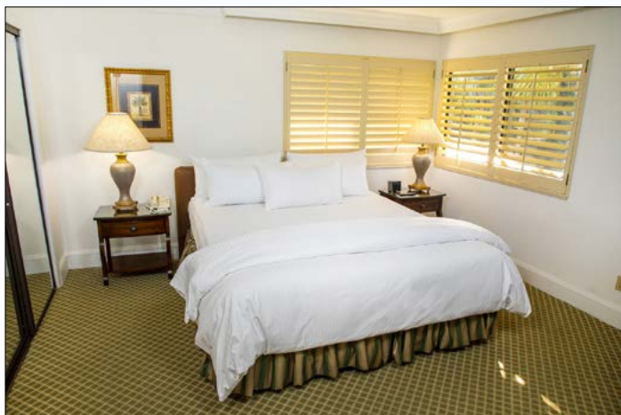
A two-bedroom suite king bed option.