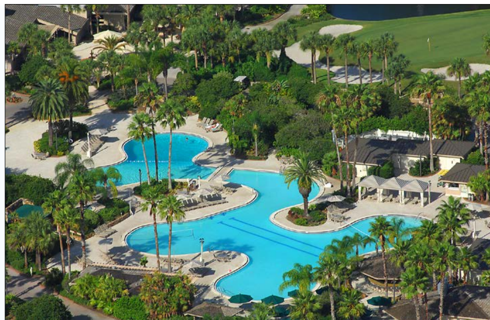
The beautiful pool at Saddlebrook.

Saddlebrook formally opened in 1981, with a unique car-free Walking Village design that allows guests to easily walk throughout the