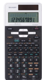
Sharp 272 Function 10-Digit 2 Line Display Scientific...