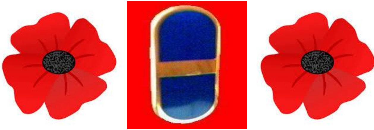
Figure 5: Image of a lapel insignia for Flight Officers.