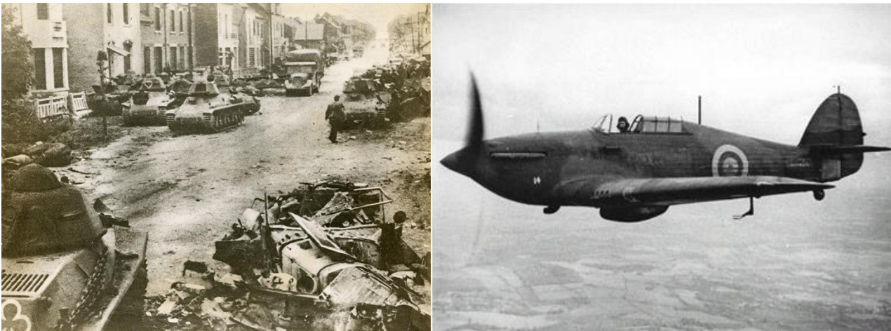
Figure 6: Image from the ground portion of the Battle of France.

The Battle of France occurred when Germany invaded France. Over the course of the battle, Italy joined forces with Germany on June 10, 1940. Dickey was part of Squadron no. 3 for the RAF. His unit deployed to France to aid the British during the battle. While they took down 60 German aircraft, they lost 21 of their own. Following these losses, they retreated. We can infer that Dickey's aircraft was among the 21 ships that were lost. Ultimately, the Battle of France ended in victory for Germany.