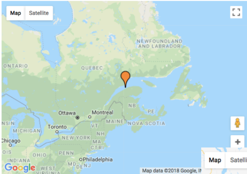
Location of attack on HMCS Raccoon .