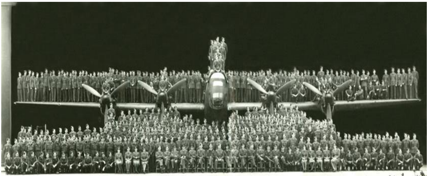
RCAF 408 Squadron