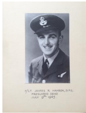
WHS soldier profile