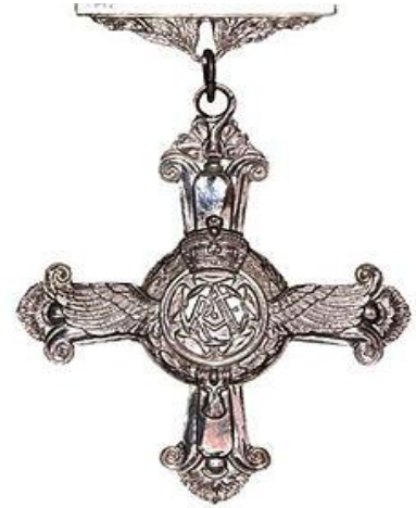
Distinguished Flying Cross