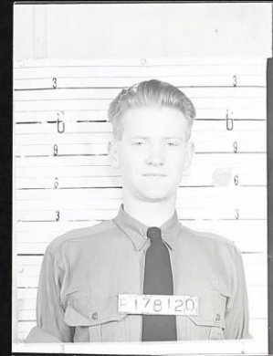
Height: 5'8" Weight: 150lb