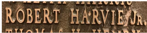
Name on the Westmount Plaque