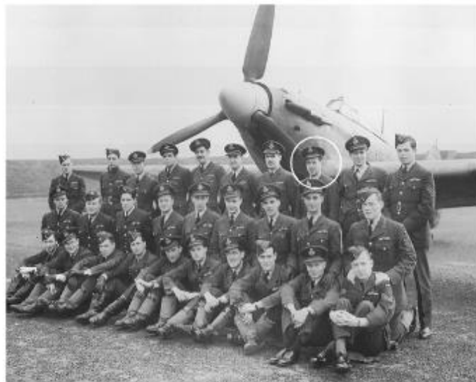
RCAF Number 1 Fighter Squadron in May - July 1940.