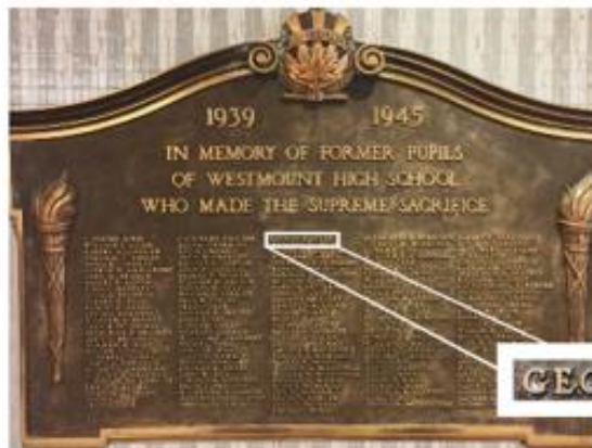
Westmount High School Memorial