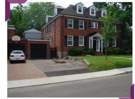
The family's house back then and now.