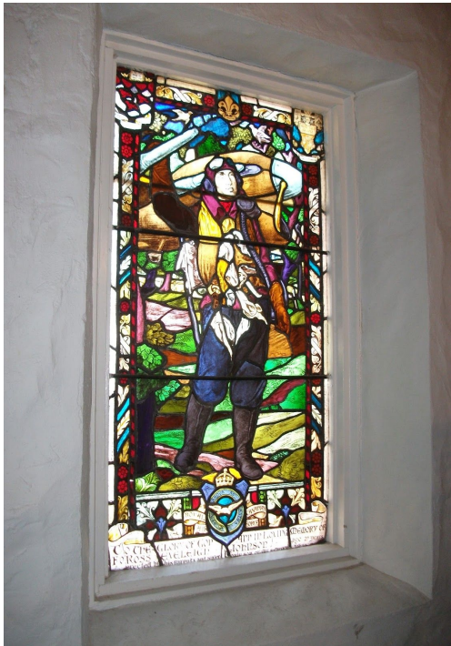
△ Stain glass dedicated to him at the Mountainside United Church in Westmount