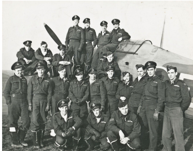
△ Group photo of Squadron 438 (RCAF)