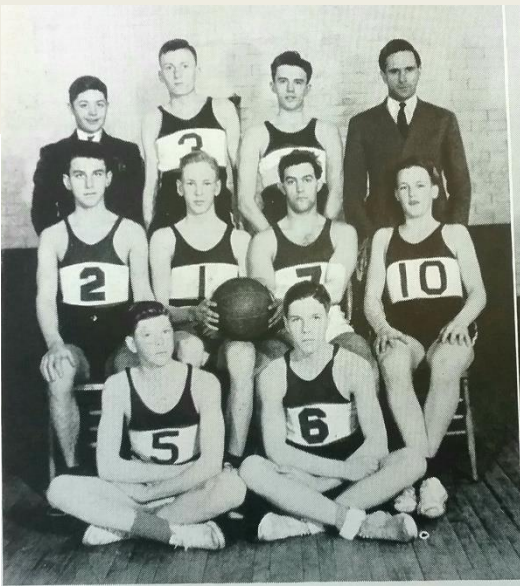
SENIOR "B" HOCKEY AND BASKETBALL