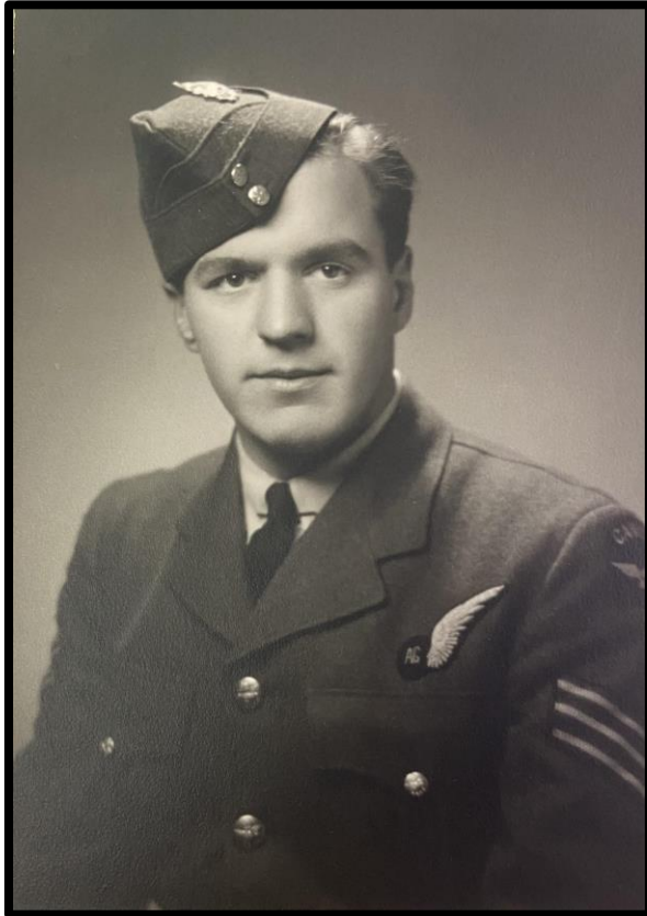
Rank: RCAF-Air Gunner