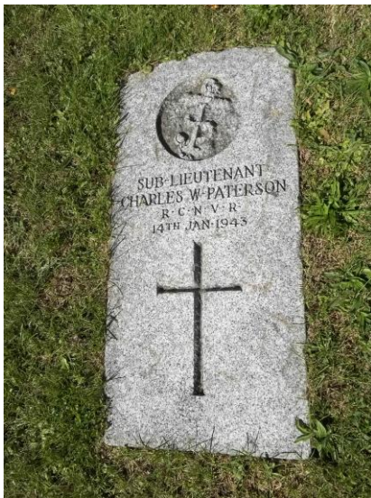
Here is where he was buried.

Cemetery: Montreal (MOUNT ROYAL) CEMETERY Quebec, Canada