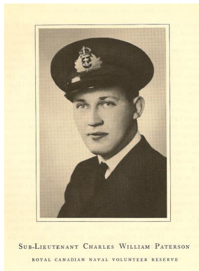
From the 1934 yearbook