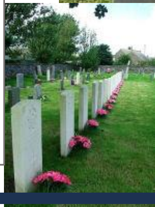
Haverigg Churchyard, Millom, England