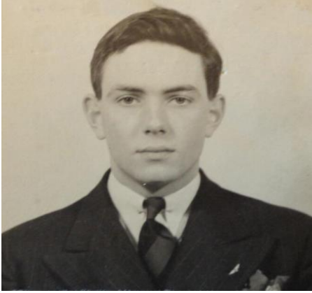
Born May 8 th , 1921