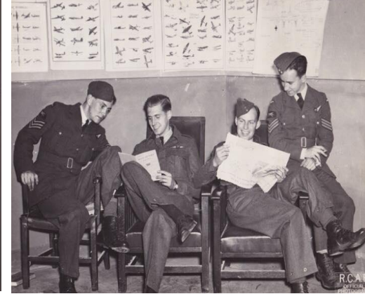
Died: February 26, 1942 at the age of 20