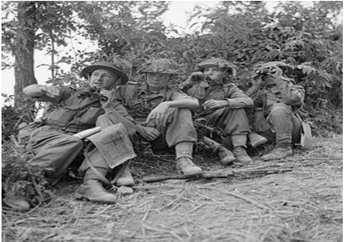
This is a picture is from the Battle of Gemmano on September 4