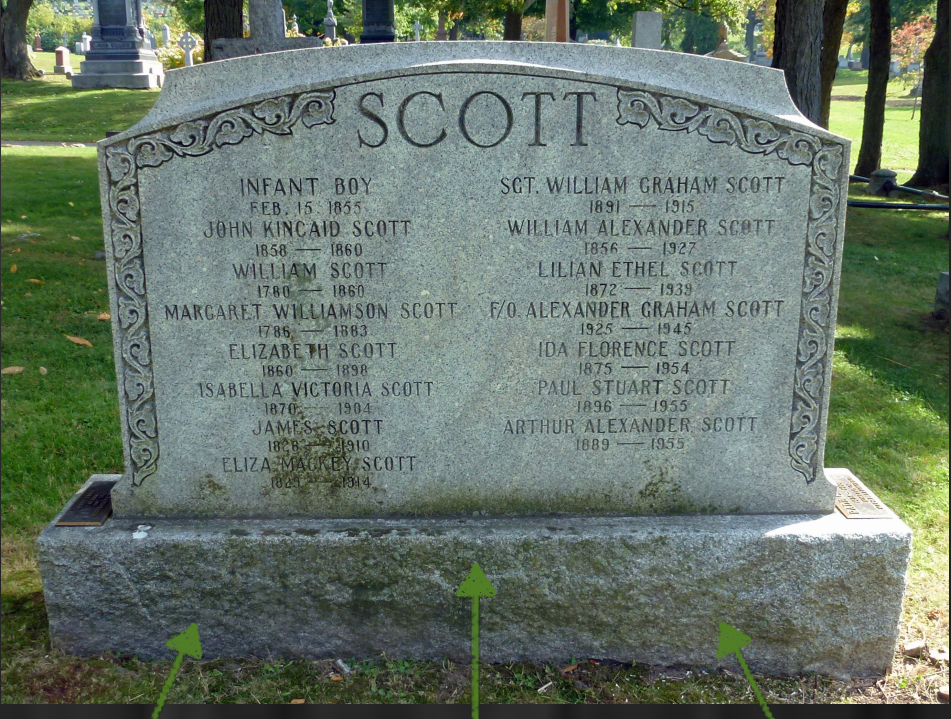
This is the family tombstone